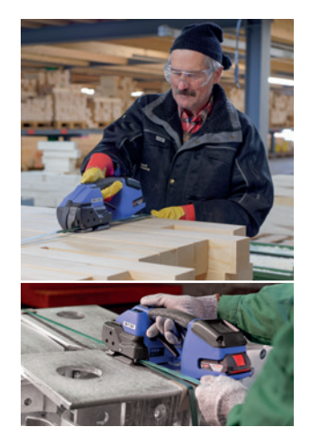
MODEL OR-T 260 For universal applications