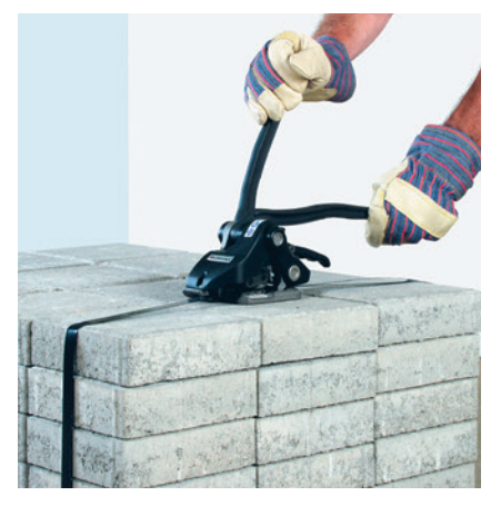
HAND TOOLS FOR STEEL STRAPPING

For flat and round packages, tensioning and sealing manually or pneumatically